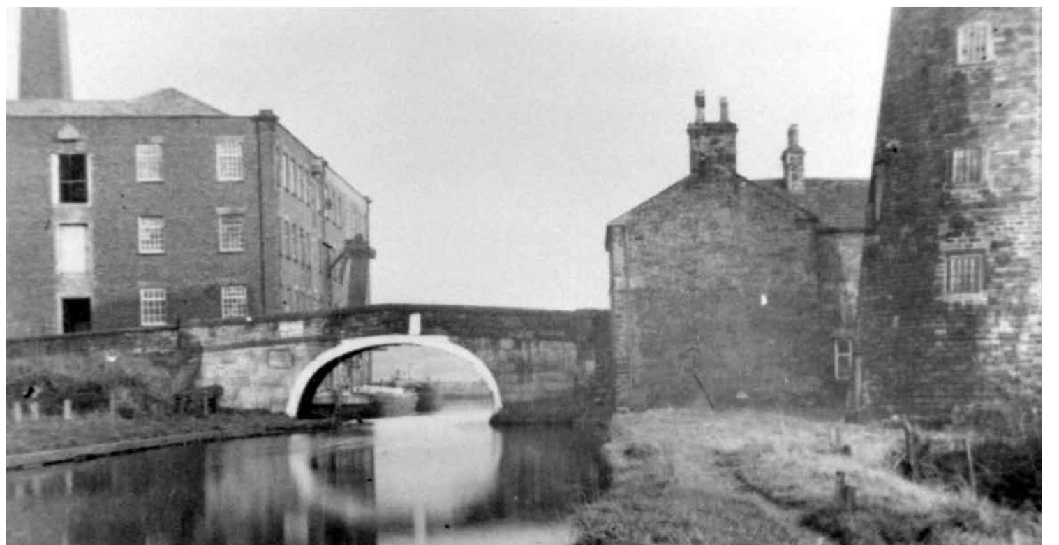
Ainscough's new mill at Parbold on the left, with the old windmill on the right.