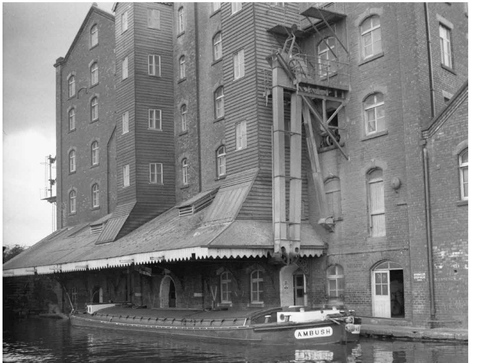
Ainscough's had mills at Burscough and Parbold, and were regular users of the canal. Here Ambush is unloading at Burscough in 1958.