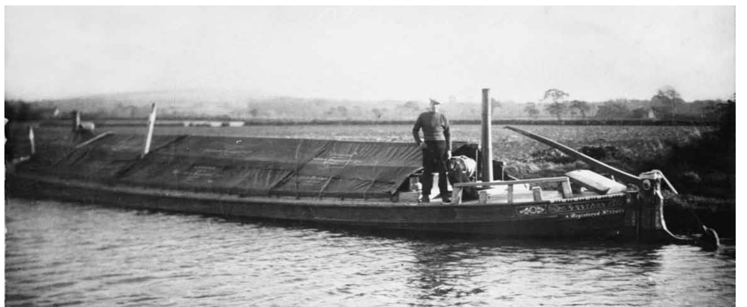
Here, Appleby's horse boat Leopard has been photographed at Ring O'Bells. The firm had mills on the canal at Bootle, Blackburn, Clayton and Burnley.