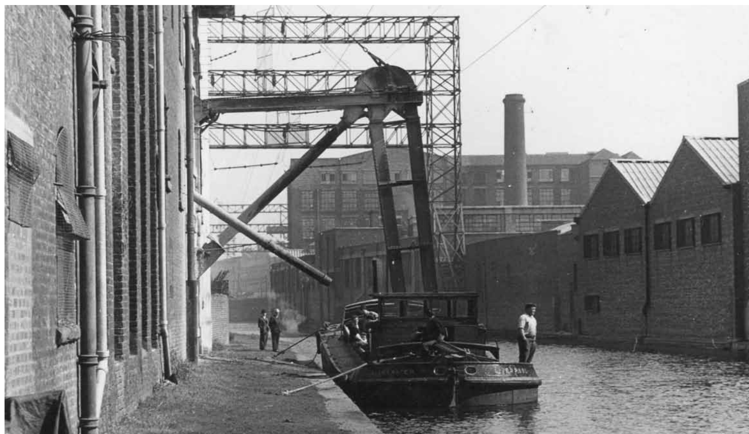
There were several canalside flour mills in Liverpool. Here, Elleswater is delivering grain to the North Shore Flour & Rice Mill between Boundary Street and Sandhills in the 1950s.