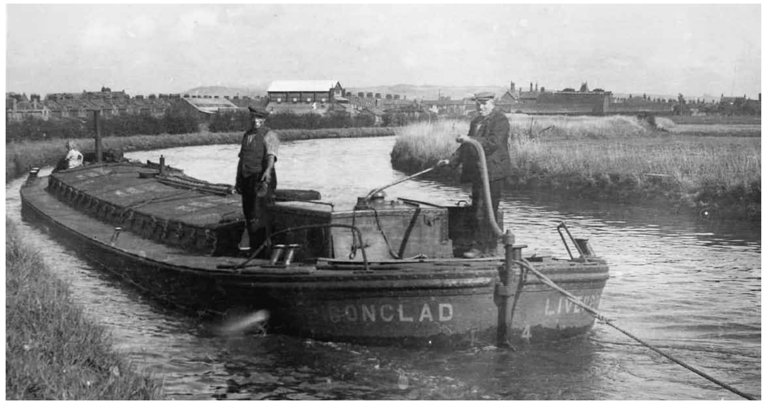
Ainscough's Ironclad approaching Burscough whilst towing one of the dumb boats, possibly Burscough or Viktorja .