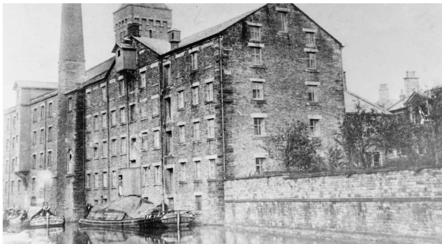
Appleby's mill at Clayton-le-Moors, with two horse-drawn boats outside awaiting unloading.